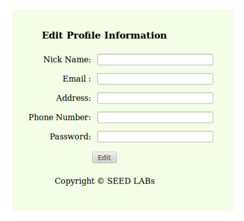
Figure 2: Edit Profile